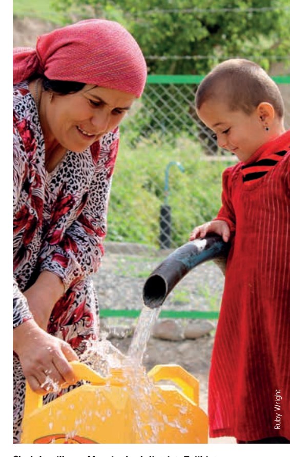
Shululu village, Muminabad district, Tajikistan.

The project aims at securing livelihoods for vulnerable women, men and children through efficient on-farm use of water and equitable community governance of water resources. The project will contribute to the adoption of measures for equitable and efficient water use by the population of target communities in their households and kitchen garden plots. This will be assisted through the education of secondary school students by improving their advocacy and communication skills to influence attitude change in their communities in favour of more equitable and efficient use of natural resources. The project will increase the capacity of local self-government and Water Users Associations in target areas to provide equal access to resources and enhanced services to the population. This will be facilitated by the use