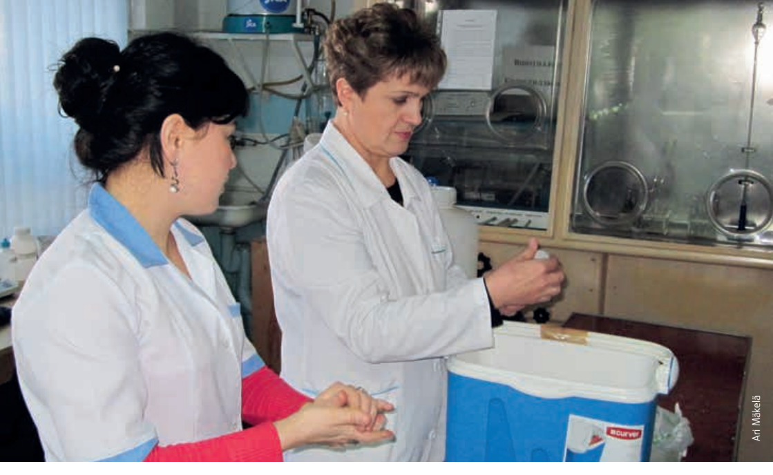
Receiving water samples in a laboratory in Kyrgyzstan.