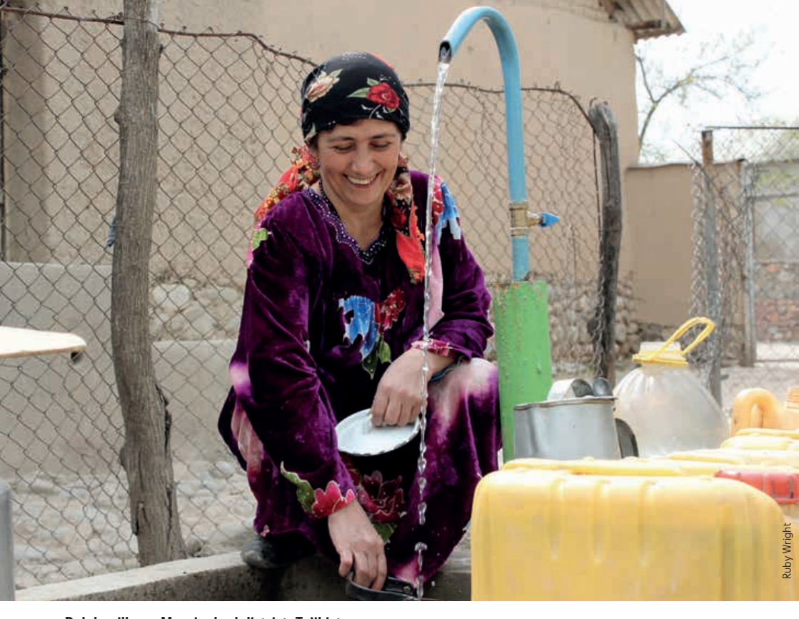
Delolo village, Muminabad district, Tajikistan.

of water sector stakeholders by training employees of water utilities, rural public associations of drinking water, and other organizations engaged in management, operation and maintenance of water supply, wastewater and sanitation systems in Kyrgyzstan and Tajikistan.