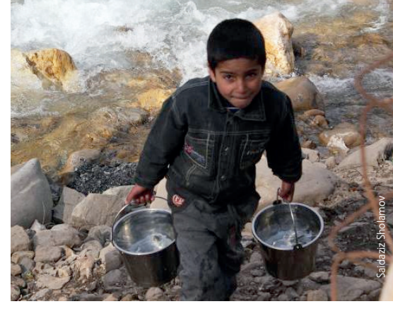
Boy fetching drinking water from a mountain river. Taiikistan.

The assessment will enable the national sector ministries, authorities and joint bodies (especially basin organisations) to better assess the interactions between water, food, energy and ecosystems in transboundary basins. The assessment will provide the following results: 1) Improved "nexus-knowledge base" of pressures on resources, needs and hotspots in the Syr-Darya basin; 2) Identification of the main inter-linkages, policy incoherencies, trade-offs and potential benefits; 3) Improved awareness of stakeholders and other actors of the Svr-Darva Basin of the nexus assessment and its policy recommendations. This assessment is part of a wider set of water-food-energy-ecosystems nexus assessments focusing on different transboundary basins in the pan-European region and beyond.