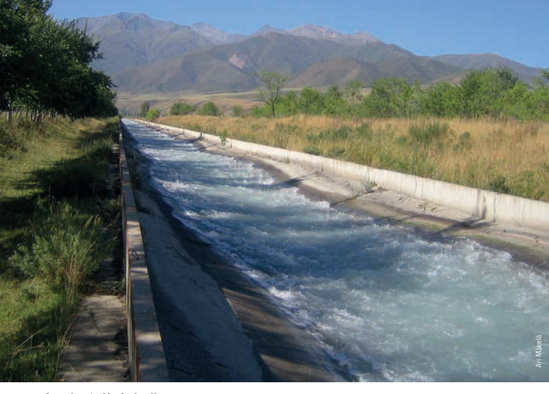
Aqueduct in Ala-Archa, Kyrgyzstan.

management and protection of water resources is expected to enhance availability of water for drinking and household use particularly in the rural areas where the poorest people suffer most of inadequate water services. On the other hand, the Programme will also provide direct support to beneficiaries in the form of awareness-raising campaigns, mobilisation of citizens for sustainable water and wastewater management as well as exploring bottom-up approaches to sustainable water management. Particular attention will be paid to mobilising women and improved mainstreaming of gender considerations in water management at different levels.