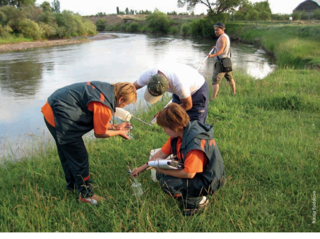
Issyk-Kul Lake monitoring, Tup village, Tup River, Kyrgyzstan.